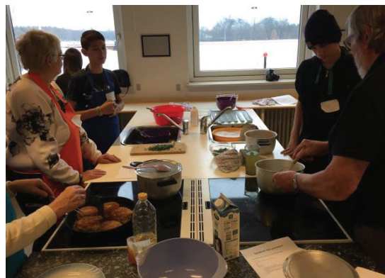
Figure 3. Children at Vallensbæk Skole welcoming pilots and passengers with flags to the left. Pilots and passengers engaged in cooking and teaching at home economics class on Vallensbæk Skole.