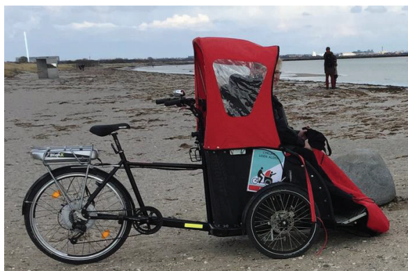
Figure 2. The original Christiania bike to the left and the slightly adjusted bike for CwA to the right. Photo to the left: Lassen. Photo to the right: Lassen, March 23, 2016.