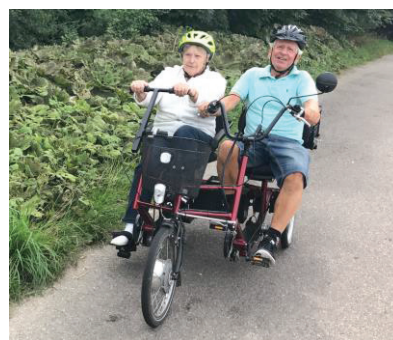
Figure 1. On the CwA, the pilot is placed behind the passenger(s) and only the pilot pedals. On the DB, pilot and passenger are next to each other and both are able to pedal. Photo to the left: Cycling without Age, June 8 2016. Photo to the right: Lassen, August 17, 2017.