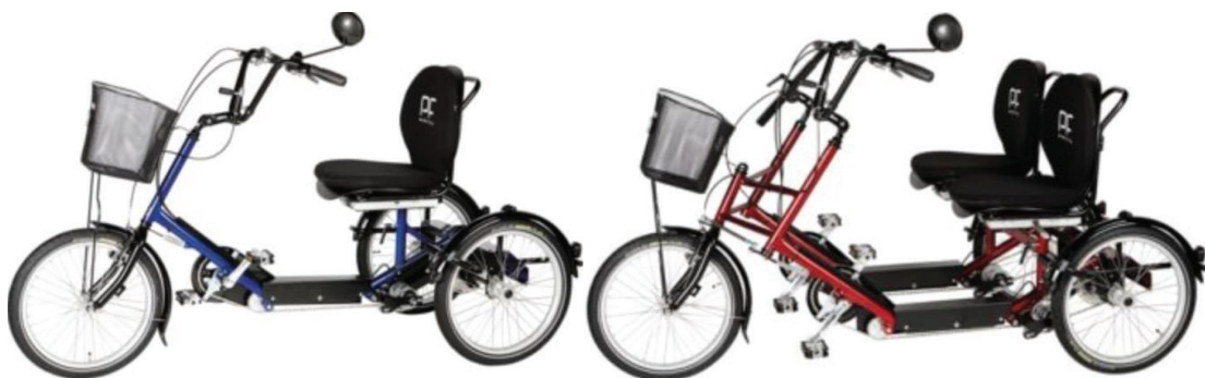
Figure 5. The solo-bike to the left and the DB to the right. Both bikes are marketed as disability bikes and stress the regaining of freedom.

The DB design has two independent drive trains connected to two autonomous hub gear systems, both pilots and co-riders being able to contribute to propulsion. However, only the pilot has a steering handle bar. PF Mobility has decided